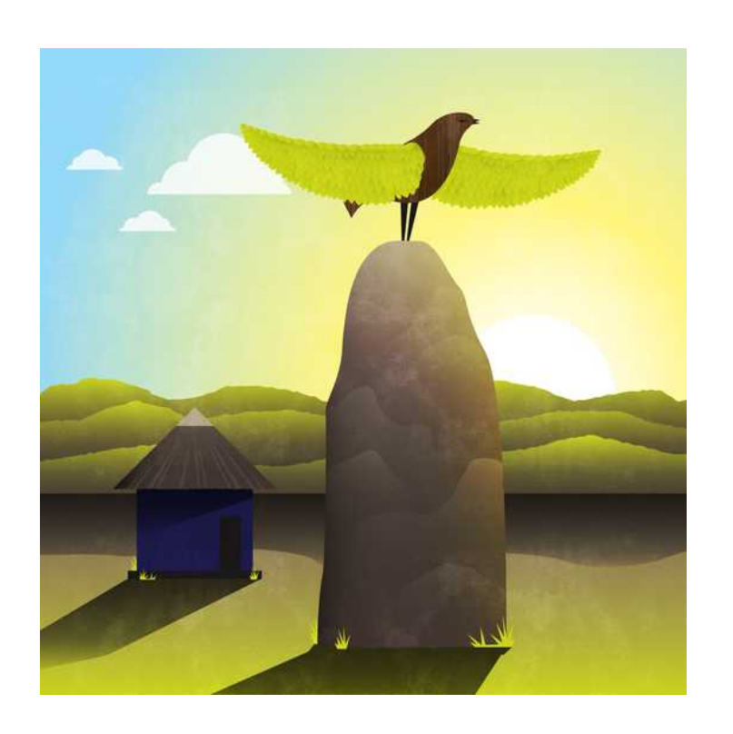
They took their bird brother up to a high mountain.