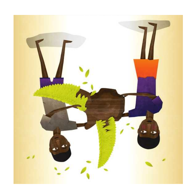
But they made a plan. They shaped the lump of melted wax into a bird.