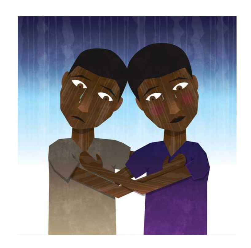
The wax children were so sad to see their brother melting away.