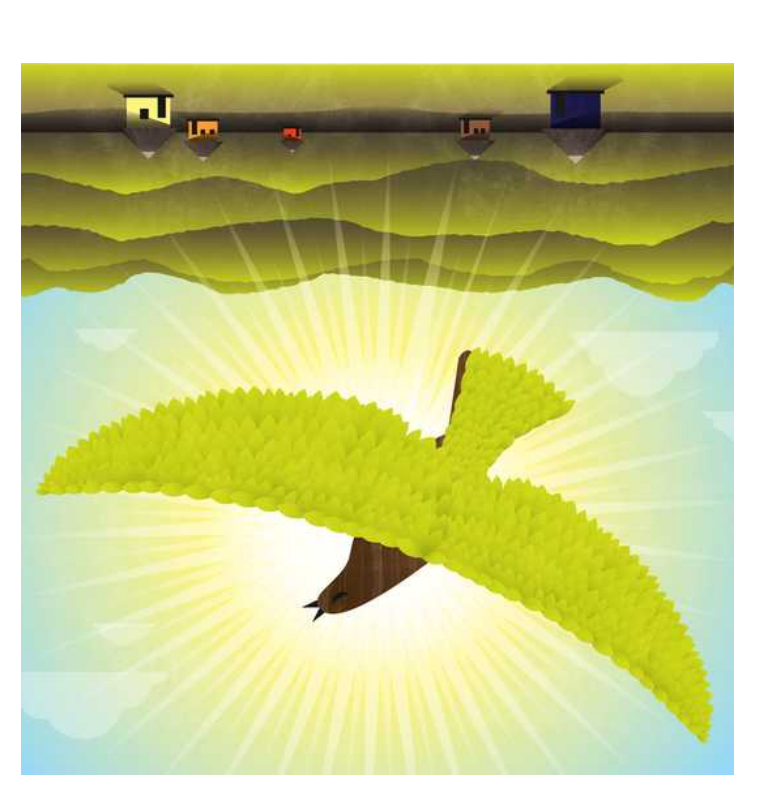
And as the sun rose, he flew away singing into the morning light.