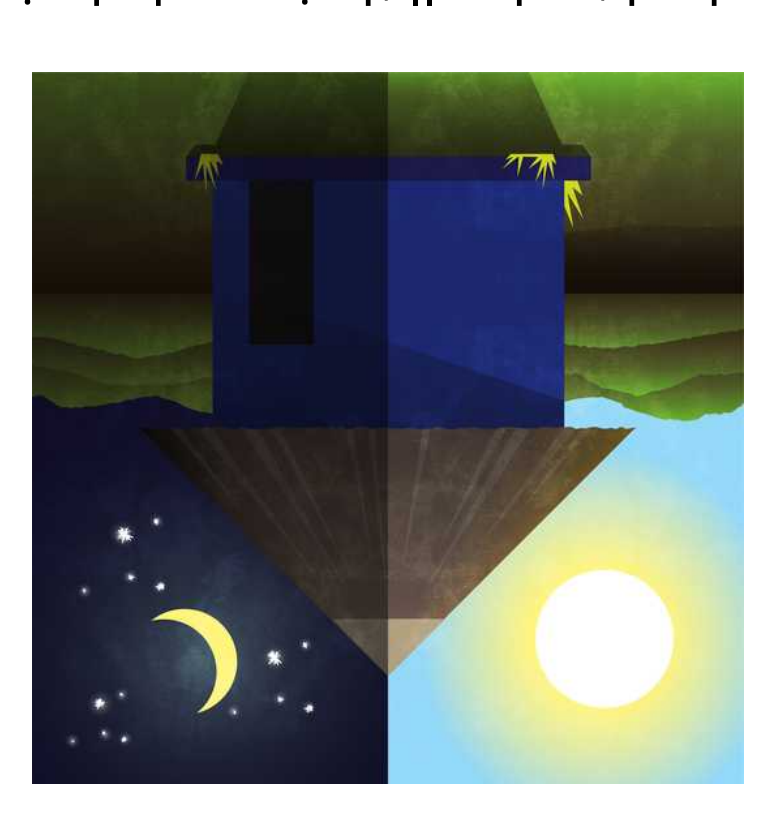
They had to do all their work during the night. Because they were made of wax!