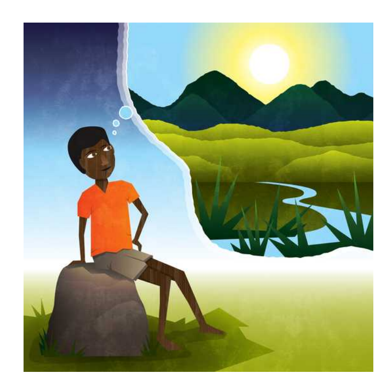
But one of the boys longed to go out in the sunlight.