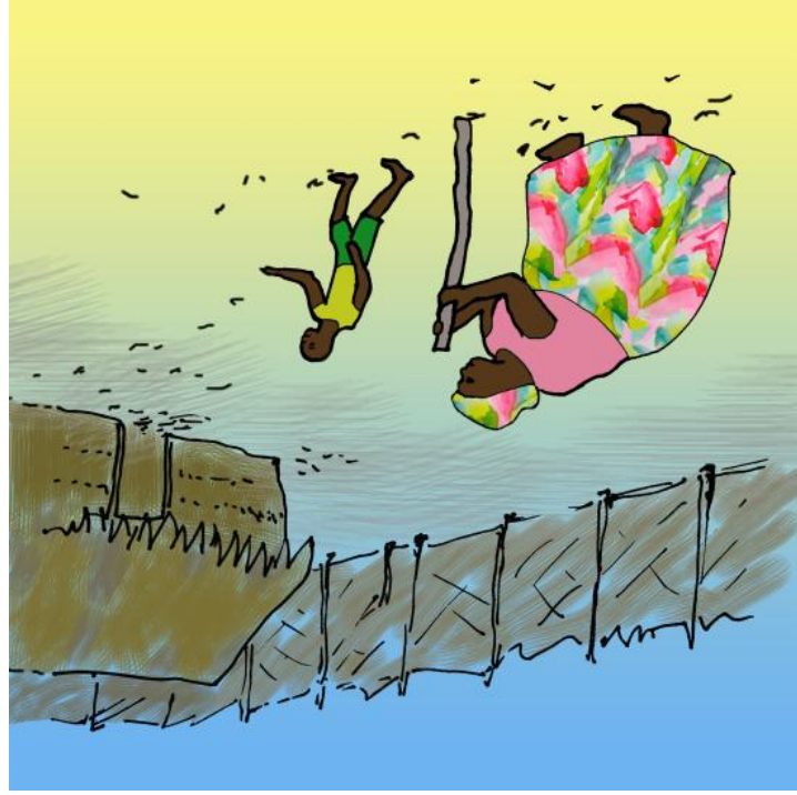
They crept home very quietly.