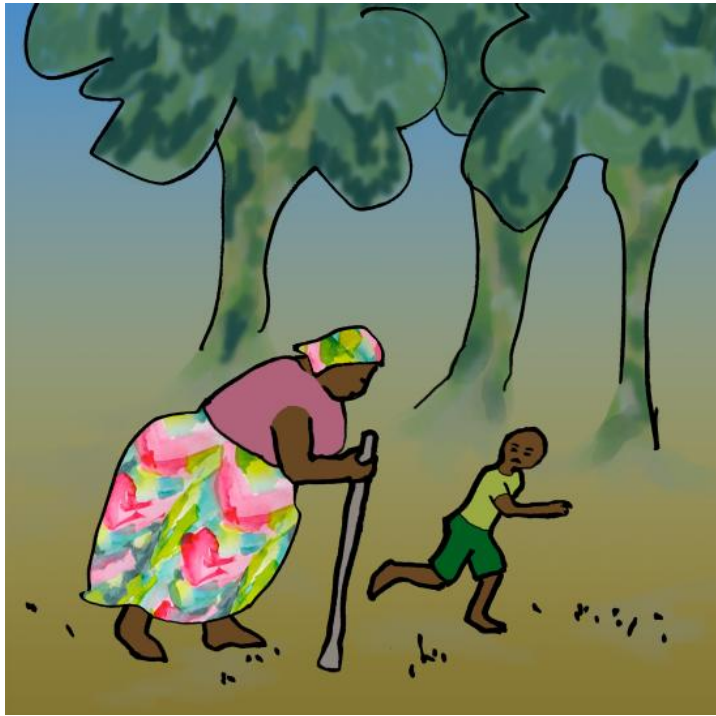
Tingi and his grandmother ran away and hid.