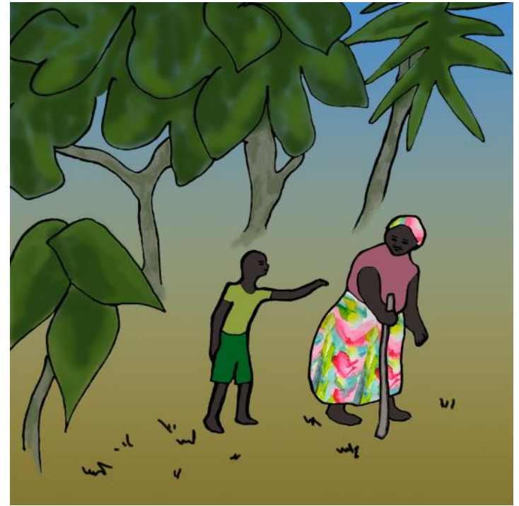
When it was safe, Tingi and his grandmother came out.